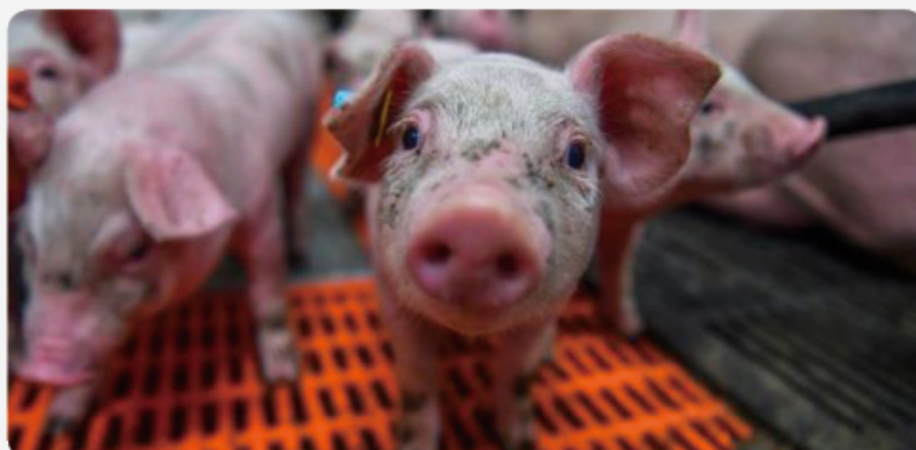
Ref : PIG PROGRESS