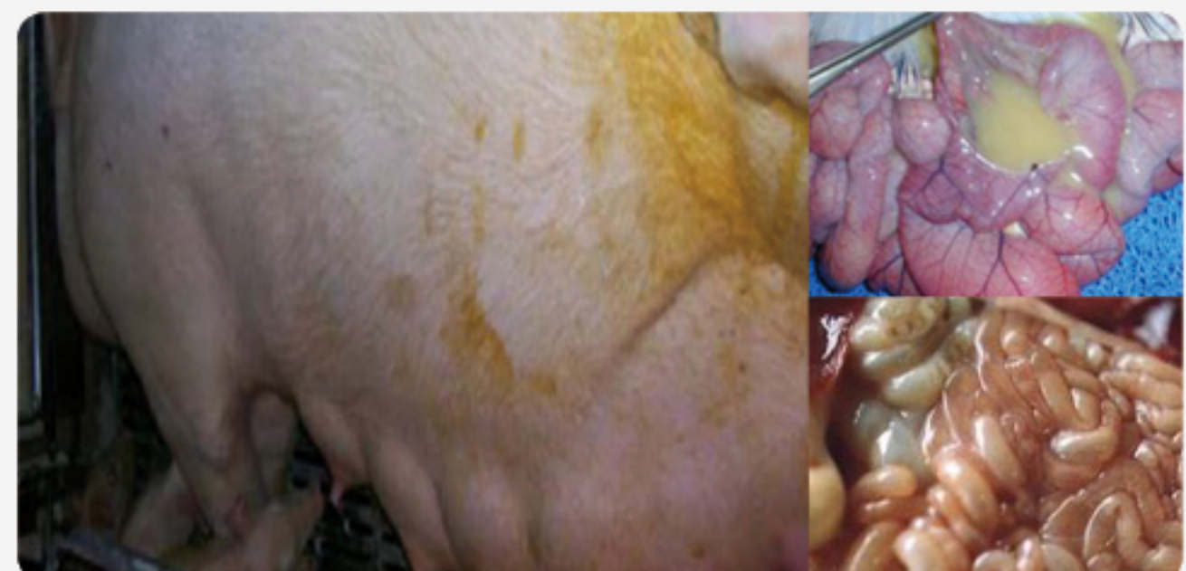
Ref : Carthage Innovative Swine Solutions, 2016